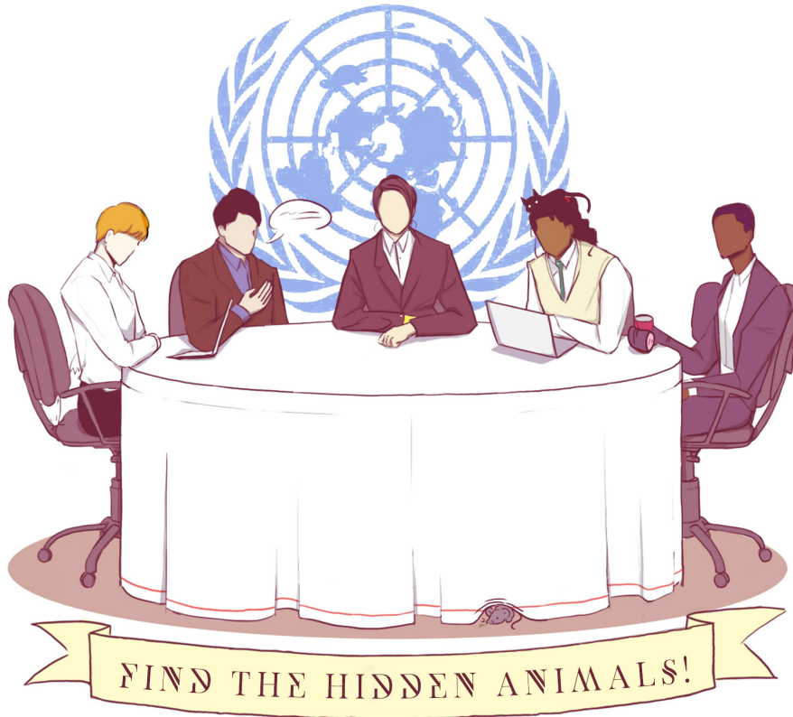
(cat, mouse, elephant, turtle, crow, arctic fox)