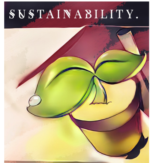
Layout by Irina Park